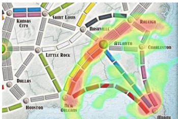
Figure 4: Dynamic Heatmap illustration. The areas in red ('hot areas) shows the area in which the player has a high number of fixations, showing a pattern.