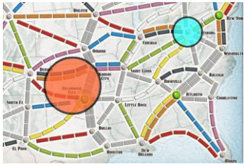
Figure 1: Gaze visualisation can be used to show the uncertainty through gaze with size. When the player looks at one area for longer, the confidence increases and the gaze point become smaller. Alternatively, the size of the gaze point can be directly reflected with the pupil diameter.