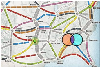
Figure 2: When two gaze points meet on the interface, their overlapped areas can be shown. In competitive games, gaze aversion may follow but can be used as deception if the second player continues to follow.